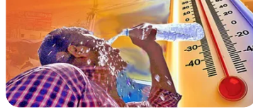
Forget Rajasthan, This UP District Is Now India's Worst Heatwave Zone At 48.2°C

For Acharya Prashant, a philosopher and bestselling author of over 160 original titles, this book represents not just another success, but a moment where uncompromising Vedanta is being embraced on the same shelves as popular fiction and international blockbusters.