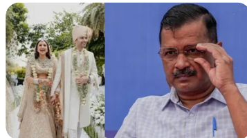
Did You Know Arvind Kejriwal Once Lifted Raghav Chadha On His Shoulders At His Wedding With...