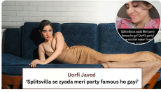
'MTV I Deserve A Raise': Uorfi Javed Reacts After Her...