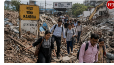
Mumbai's Garib Nagar Demolition Drive Disrupts...