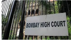
Bombay High Court Says Wives Are Not 'Deemed Maids',...