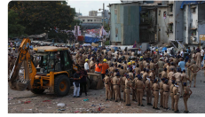
Bandra Demolition Drive 60% Complete; Stone...

With thousands of wisdom videos, his Instagram has become a unique classroom. A short reel might take up a subject like heartbreak and strip it bare, asking why love hurts the way it does. Another could break the myth of claims such as "climate change is a hoax," turning the idea on its head to make people think. Some posts are about fear, others about freedom, or even the way our choices are never as free as we imagine. Each one is made to stick, to leave a thought behind long after the scroll has moved on. Followers often say that a single line stays with them for days, quietly working on their choices and perceptions.