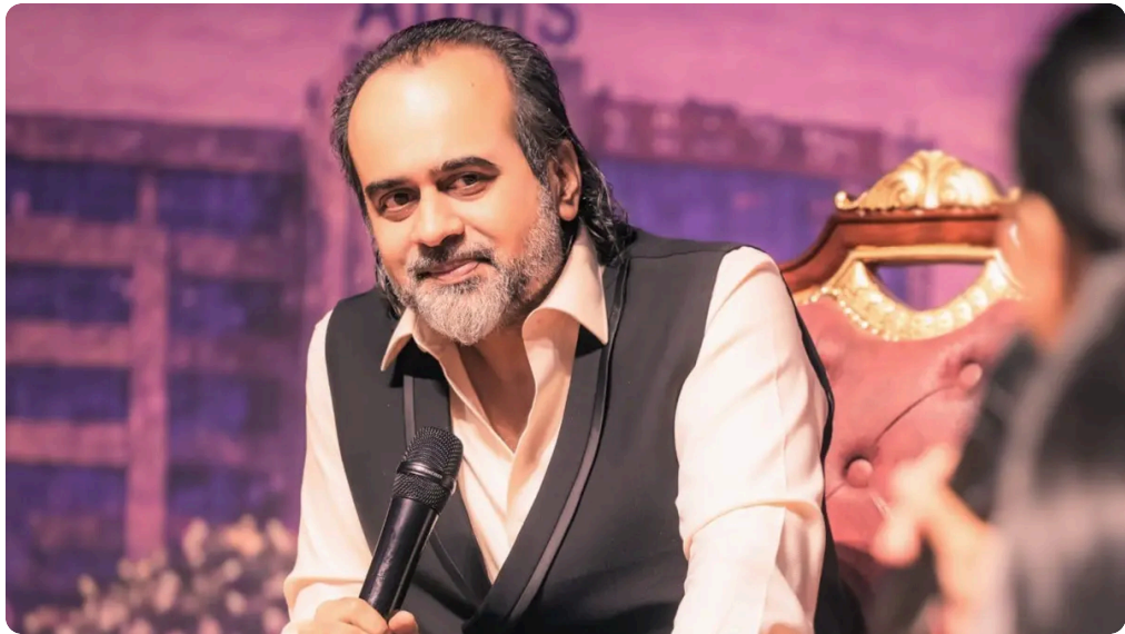
Watkins Ranks Acharya Prashant At 20th Spot — Here's What It Means