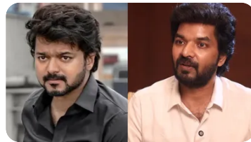
Vijay Thalapathy's Friend Jai Opens Up On Why He Embraced Islam And Considered Name...

There's no fanciness in the packaging, just honesty in the message. Readers often describe the experience with these books, courses, etc, as deeply personal and stirring, as if they were reconnecting with something long forgotten. And somehow, it's almost free.