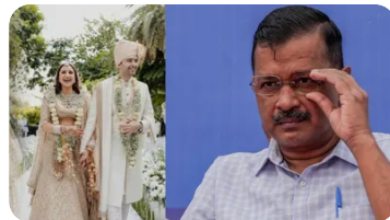
Did You Know Arvind Kejriwal Once Lifted Raghav Chadha On His Shoulders At His Wedding With...