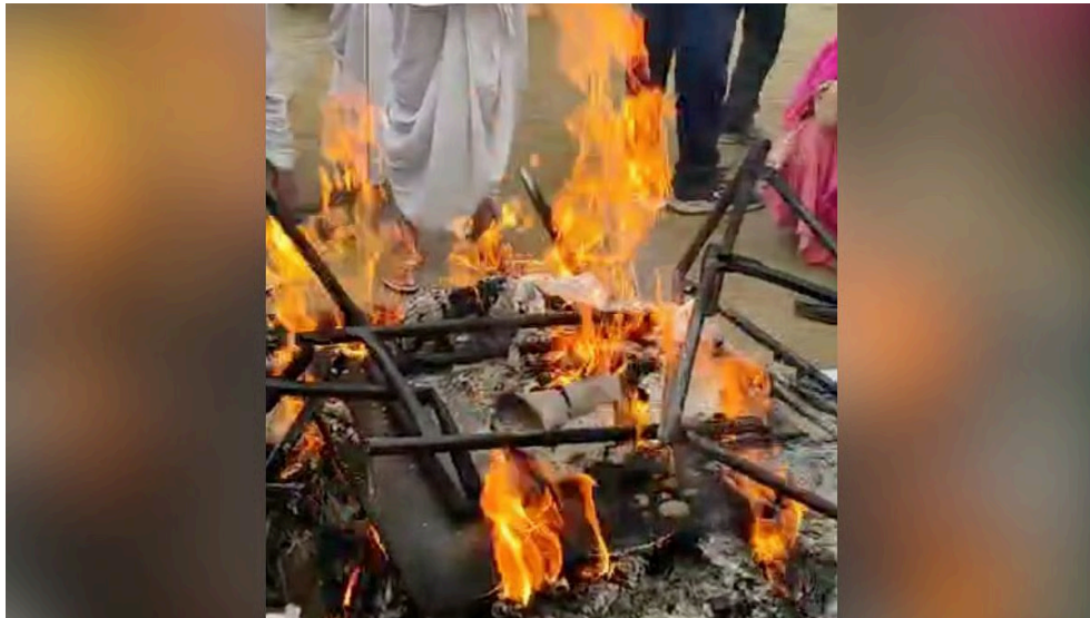
Misinformation Sparks Violence: Acharya Prashant Targeted With Fake News | File Photo