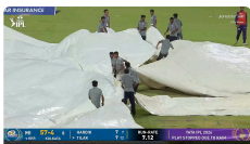
KKR Vs MI Match Stopped Due To Heavy Rain In...