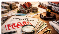
Chembur Police File FIR Against Ex-Office Bearers For...