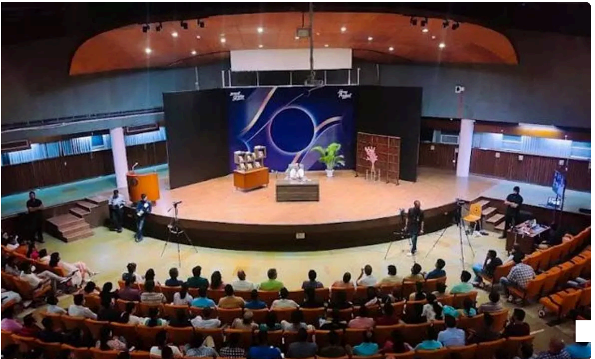
PrashantAdvait Foundation organises Vedanta Mahotsav at IIT Delhi