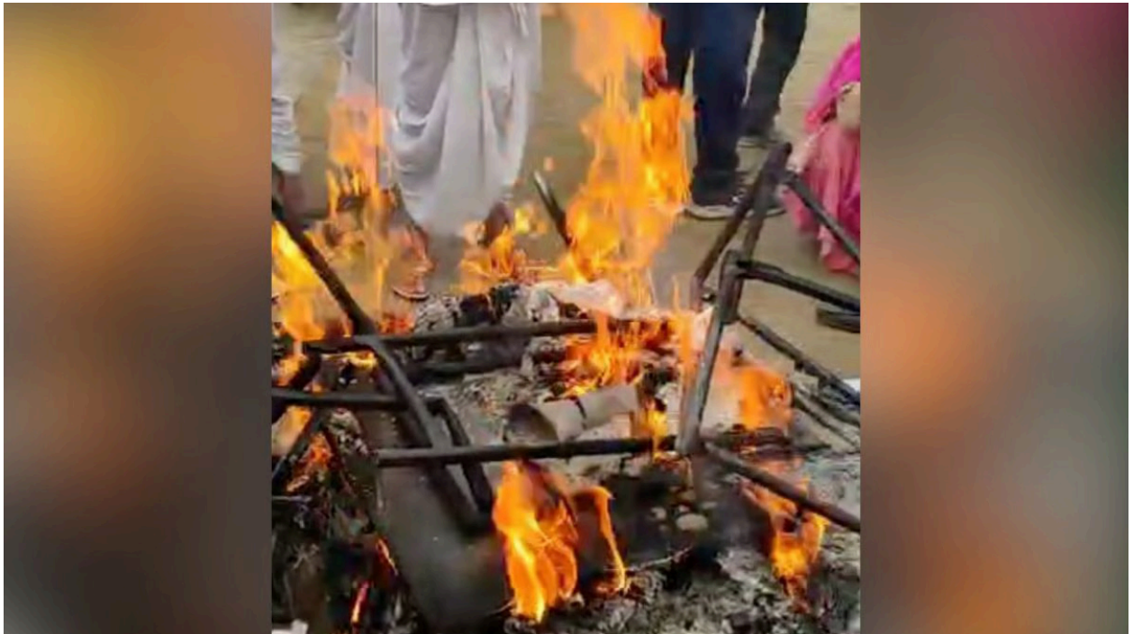
Misinformation Sparks Violence: Acharya Prashant Targeted With Fake News | File Photo

Rahul M Updated: Tuesday, January 21, 2025, 07:02 PM IST